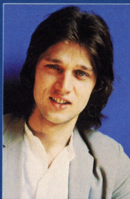
DAVID KNOPFLER Rhythm guitar & Vocals