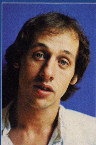
MARK KNOPFLER Vocals, lead & rhythm guitars